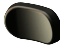
Chubbie Headrest Support Pad