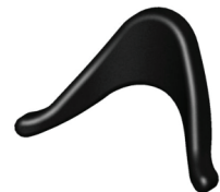
Low Profile Occipital Pad