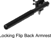
Locking Flip Back Armrest