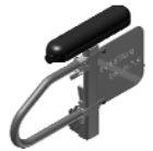
Height Adjustable Padded Armrest