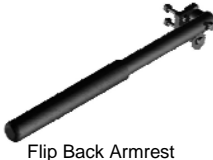
Flip Back Armrest