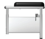
Dual Post Height Adjustable Removable Armrest