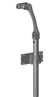
Rock & Roll Headrest Hardware