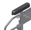
Single Post Height Adjustable Armrest