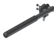
Locking Flip Back Armrest

Seat Rail to Top of Armrest Measurement _____ Inches